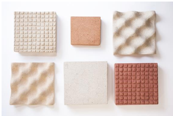
Figure 5. Small material samples and test pieces, sizes 5 x 5 cm and 10 x 10 cm.