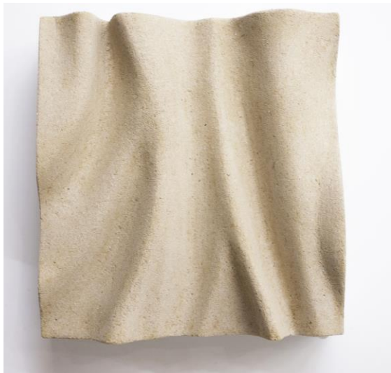
Figure 4. Designed exhibition piece, large sample 20 x 20 cm.

Surface geometry. Three-dimensional shapes can invite touching of the material. This experience can be designed in advance by designing fascinating shapes. The moulding technique enables the making of the three-dimensional shapes, repeatable forms or extremely smooth designed surfaces, manufactured at one time. In this study, the surface geometry has been studied by making regular pattern-like forms, regular free-formed shapes and complete free-form surfaces. Shaping was successful and easy to implement using the selected technique.